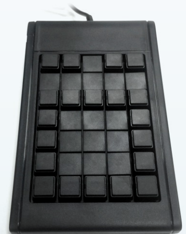
Custom Layout Example