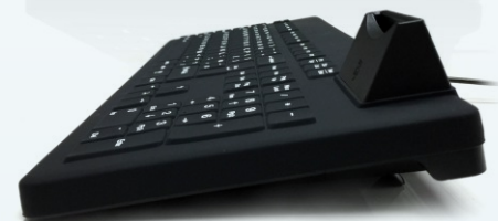
Keyboard Tilt using Fold out Feet